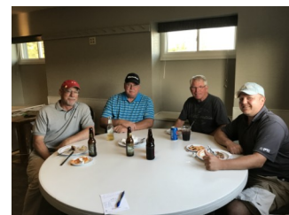
"We almost won!"