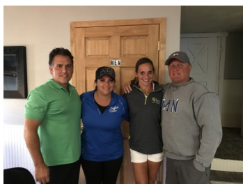
Buffalo House golf team and generous sponsors.