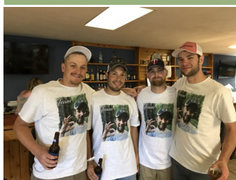
Team uniform shirts.