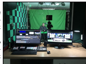
Green Screen and Studio

To access Rails TV, go to Youtube and search for RailsTV. All broadcasts are archived in Youtube and may be watched at any time. If a person subscribes to the Youtube channel (free), he or she will receive notification whenever a new video or live event will be broadcast. Another way to see the videos is to go to www.railstv.net . REA 3 D is proud to be a valued sponsor.