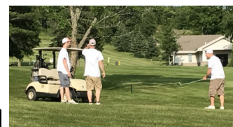
Getting ready to tee off.