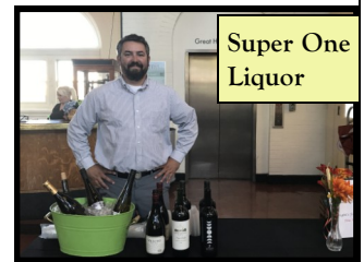
Super One Liquor