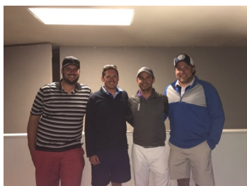
Second year team members.